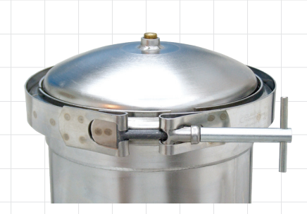
Band Clamp Assembly