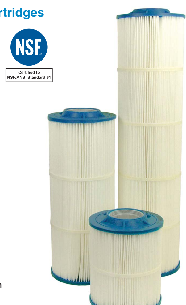
Premium Hurricane® Harmsco-Free Cartridges

High flow capability Lower overall operating cost Reduced waste disposal Longer filter runs for fewer change-outs Increased contaminant removal Operator friendly