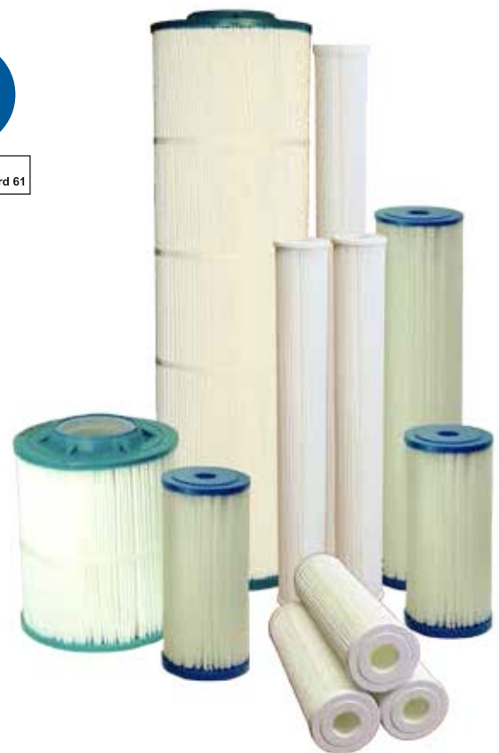
Harmsco® Microfiber Series Cartridges